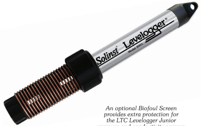
An optional Biofoul Screen provides extra protection for the LTC Levelogger Junior pressure and conductivity sensors in harsh environments.

Using the natural anti-fouling characteristics of copper, the Biofoul Screen is an affordable option to lengthen the time an LTC Levelogger Junior can be deployed. It reduces site visits and time spent cleaning Leveloggers, and improves long-term performance by ensuring accurate sensor measurements.