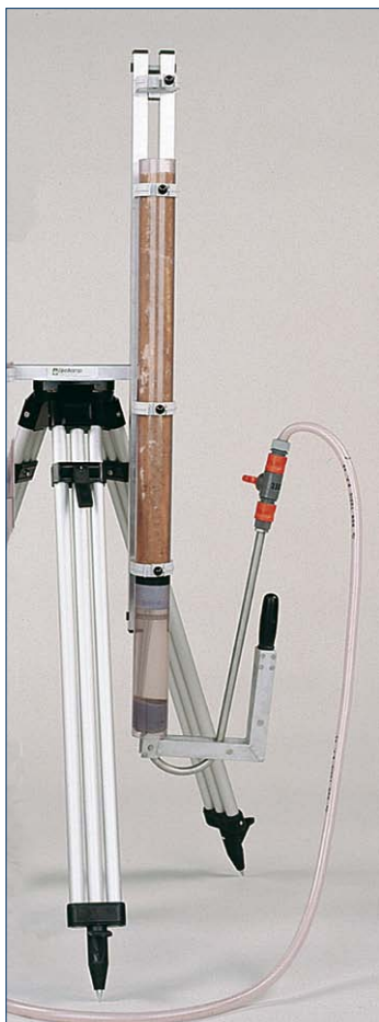
Discharge and partitioning system (04.23.SB set)